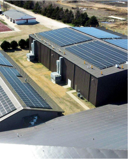
Oklahoma Bible Academy Private Middle & Secondary School