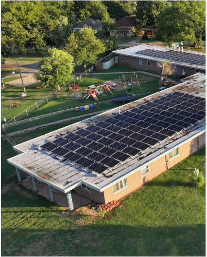
Hope House Nonprofit Shelter & Support Center