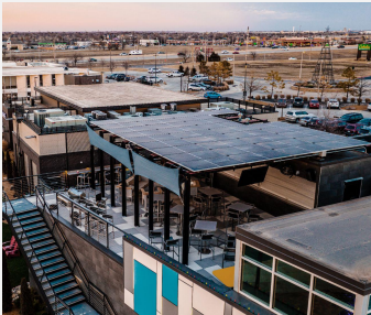
Chalk Sports Restaurant / Sports Bar