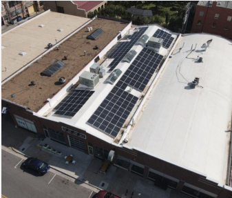
Vanessa House Craft Brewery & Taproom