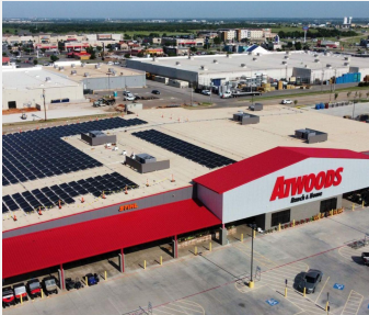
Atwoods Retail Store