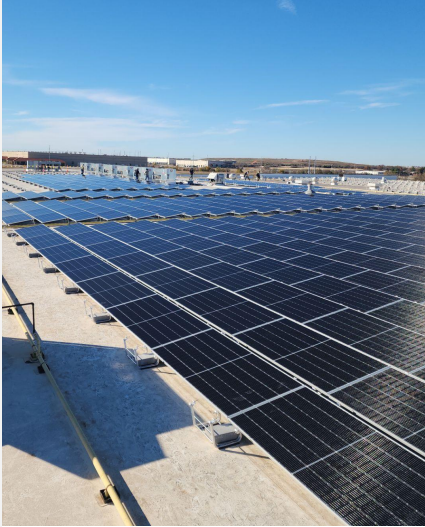
Regional Food Bank of Oklahoma Food & Resource Center