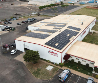
CARSTAR Collision Center Automotive Center