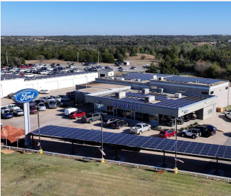
Vance Automotive Auto Dealership