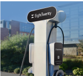
EV Charging Stations