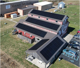
Pasture at Marksbury Farm Market & Retail