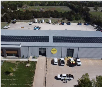
Pella Windows & Doors Showroom & Warehouse