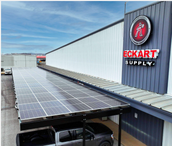
Eckart Supply Electrical Supply House