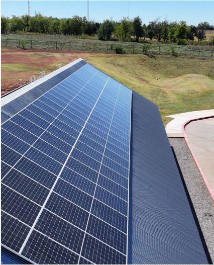
The Academy of Classical Christian Studies Private Christian School (Grades K-12)