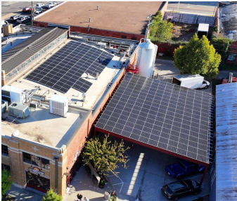
Stonecloud Brewing Company Craft Brewery & Taproom