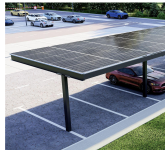
Solar Carports & Structures