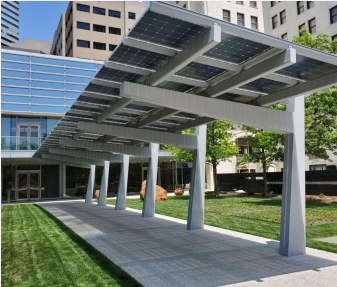
Devon Energy Company Headquarters